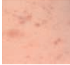
Back Acne Before