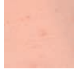
Back Acne After

This pamphlet is intended to provide general information only. For details pertaining to your specific situation, consult your physician or aesthetic practitioner.