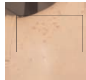
Left-Not Treated (Control)